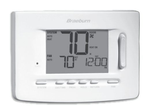
Figure 1 • TH-BR52 Thermostat

To avoid electrical shock or damage to equipment, disconnect all power before installing or servicing.