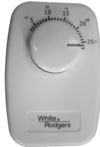
Figure 1 • WR-S Thermostat

Additional Features: Snap action switch, double pole, CSA Certified.