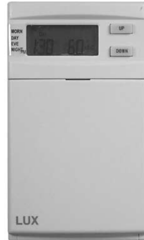
Figure 1 • TH-PSPLV Thermostat

Range: 45°-90°F Differential: ±1°F Adjustable Operation: Single stage; line voltage Electrical Rating: 120-240 VAC; 16 Amp max; non-inductive Contact Action: Opens on rise. Dimensions: 4.7" x 2.7" x 2.4" Additional Features: Separate 5-day (weekday) and 2-day (weekend) programming, program override with vacation hold, UL Listed.