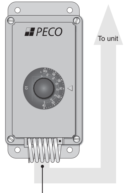
Figure 1 • TH-109 Thermostat

Ensure the 1/2-inch conduit opening on the end of the enclosure is installed downward. With cover and NEMA 4X conduit fittings (not included) properly installed, the enclosure will meet NEMA 4X rain-tight ratings. NOTE: A drip-loop should be provided to prevent water and other liquids from entering the thermostat housing. Failure to use suitable watertight connections could result in thermostat failure.